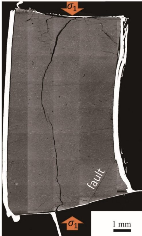
Fig. 3.6-3: Backscattered electron image of Sample A (grain size: < 10 \mu\text{m} ). The vertical direction corresponds to the maximum compression direction ( \sigma_1 ). A fault cuts the lower right part of the sample.